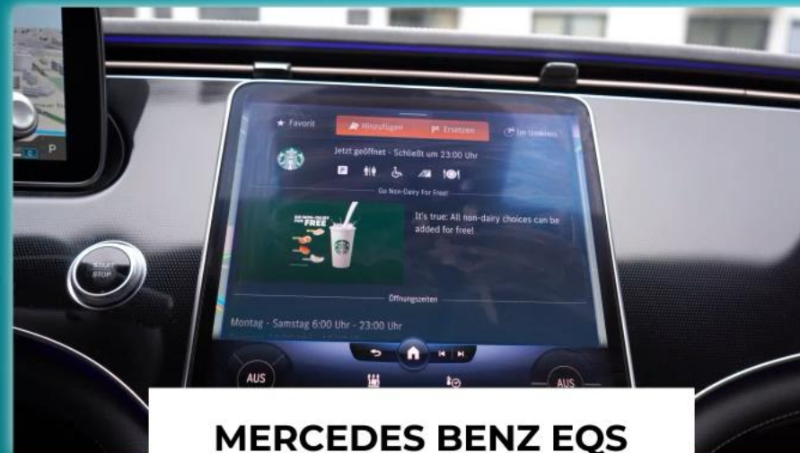
MERCEDES BENZ EQS