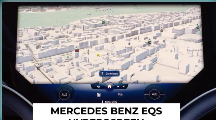
MERCEDES BENZ EQS HYPERSCREEN